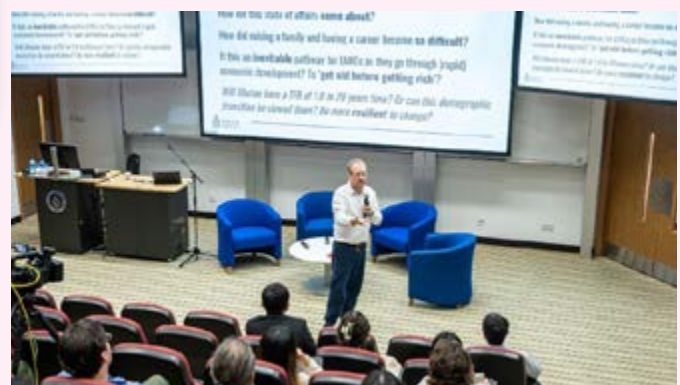
Prof. Gietel-Basten delivering the keynote speech on Day 2 of the AP|PPN Conference