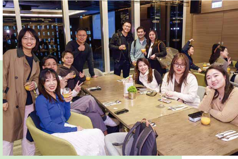
MPM Home-coming Dinner