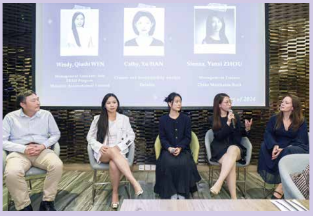
MPP Home-coming Dinner